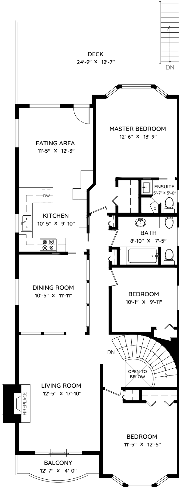
MAIN FLOOR 1,453 SQ.FT. CH: 8'-0"